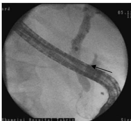
Figure 2. Endoscopic retrograde cholangiopancreatography imaging window showing a foreign body (black arrow) in the CBD before sphincterotomy

Foreign bodies in the biliary tree are rare causes