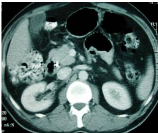
Figure 1. Spiral computed tomography (CT) scan showing a shrapnel splinter (right arrow) in the periampullary area near the head of the pancreas

of the liver, right kidney, subcutaneous tissue, and one in the periampullary area near the head of the pancreas (Figure 1). The latter one was presumed to be the probable cause of the patient's symptoms, thus the patient underwent a diagnostic endoscopic retrograde cholangiopancreatography (ERCP). There was a narrow segment dilatation in the common bile duct (CBD) and a filling defect in the CBD portion, which suggested a foreign body with a size of 5×7 mm (Figure 2). Subsequently, a sphincterotomy was performed and the foreign body, which was similar to shrapnel splinter, was pulled from the duct with a basket (Figures 3 and 4). The patient was assessed in the outpatient clinic two weeks later and found to be in good condition without evidence of jaundice or abdominal pain. Laboratory tests were within normal limits.